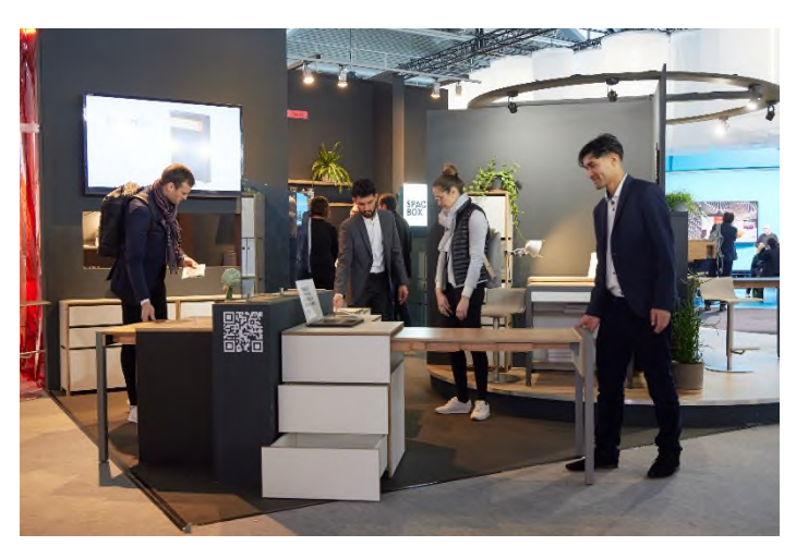
Office Design & Solutions and the Future of Work area move to the east side of Hall 3.1 in the attractive design environment.

Premium suppliers of intelligent furnishing concepts for the classic office, co-working spaces, home offices and for mobile and hybrid working will continue to find their home in an attractive interior design environment under the new title "Office Design & Solutions". However, they will move to the east side of Hall 3.1 - closer to the Forum and the Festhalle.